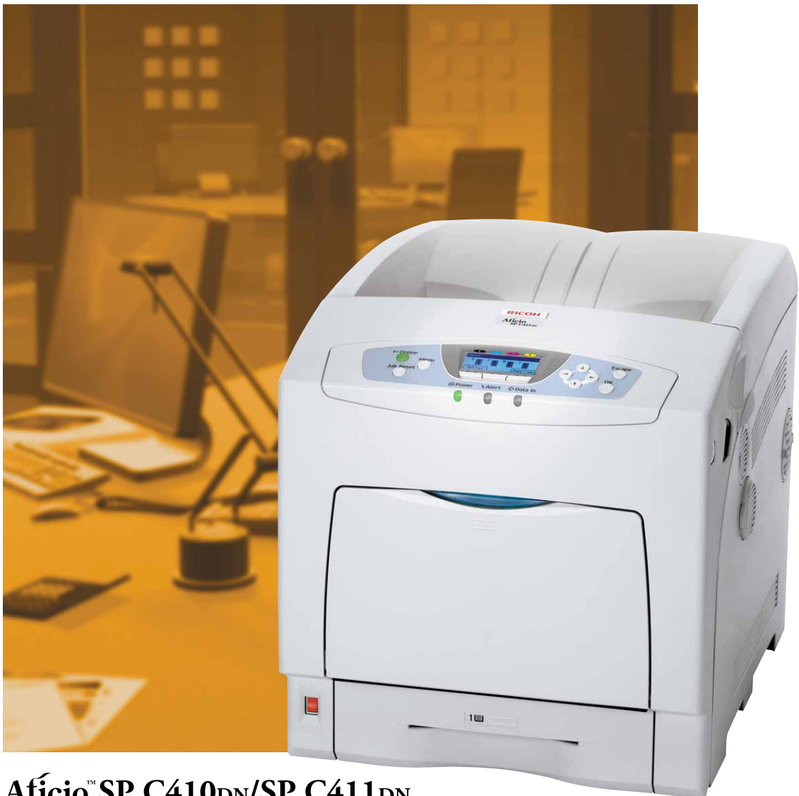
Aficio™ SP C410DN/SP C411DN

Cost Cutting High Performance Colour Printing